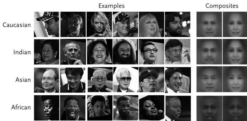
FIGURE 4: Examples and Composites from Racial Faces in the Wild Database

The ghostly gendered ‘racial’ blurs on the right could be called a vertical group photo, in which people are not located side by side but one on top of another. How did they come into being?