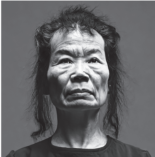
FIGURE 2: Stable Diffusion's 'Image of Hito Steyerl'