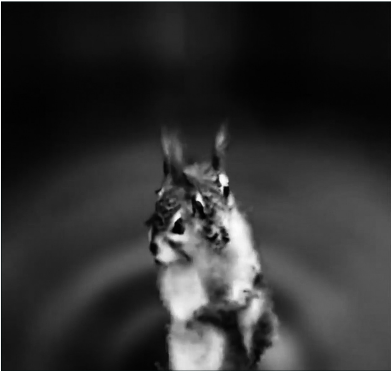
FIGURE 3: 3D ML-Generated Model of a Squirrel with Three Faces