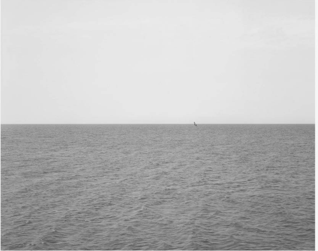
Trevor Paglen. NSA-Tapped Fiber Optic Cable Landing Site, Norden, Germany , 2015. Courtesy the artist; Metro Pictures, New York; Altman Siegel, San Francisco.